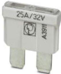
Flat-type plug-in fuse, type C, color code: white, nominal current: 25 A

Please be informed that the data shown in this PDF Document is generated from our Online Catalog. Please find the complete data in the user's documentation. Our General Terms of Use for Downloads are valid ( http://download.phoenixcontact.com )