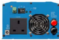
Phoenix Inverter 12/800 with BS 1363 socket