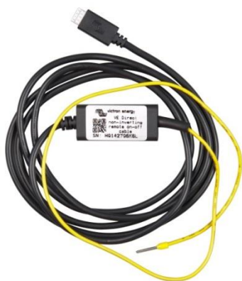
VE.Direct non inverting remote on-off cable

Switch off level: input voltage must be less than 1V or must be free floating