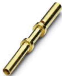
crimpcontact, gedraaid, contactdiameter: 0,6 mm, crimpbereik: 0,34 mm 2 ...0,5 mm 2

Please be informed that the data shown in this PDF Document is generated from our Online Catalog. Please find the complete data in the user's documentation. Our General Terms of Use for Downloads are valid ( http://download.phoenixcontact.com )