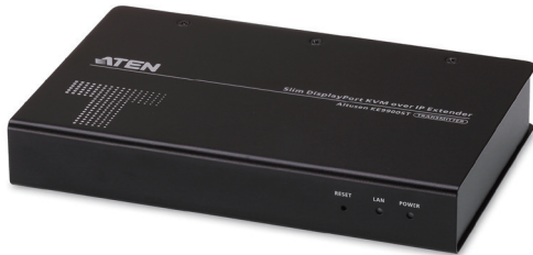
KE9900ST Front View