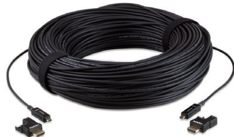
VE7834 / VE7835