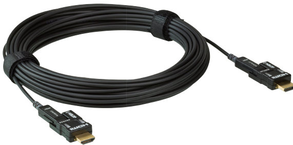
VE7832 / VE7833